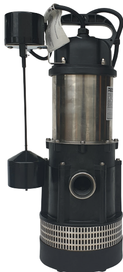
RHS105VF | 20043